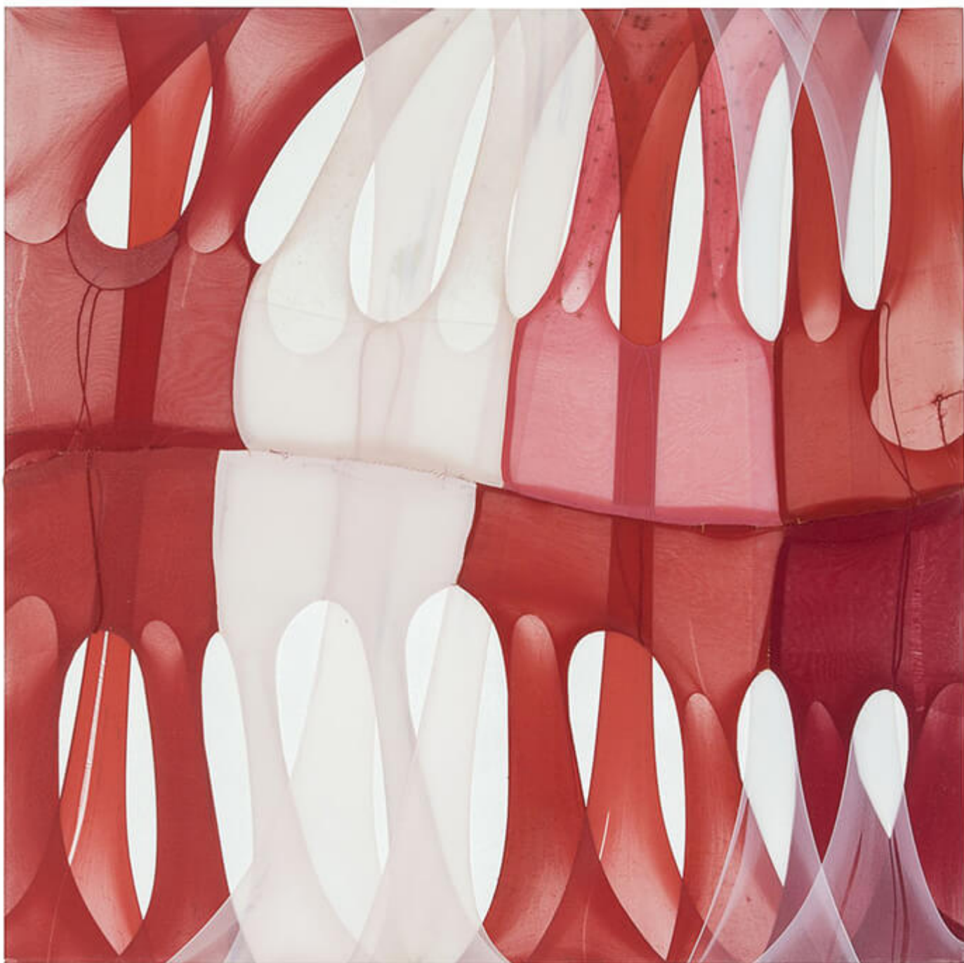
Sipumelelo 1 / Turiya Magadlela / 2016

“I make my work from my personal life experiences.”